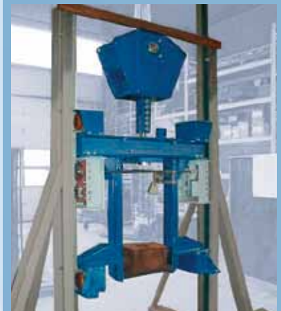
Crosshead with freefall arrestor on testfield

www.ruhrpumpen.com email: info@ruhrpumpen.com