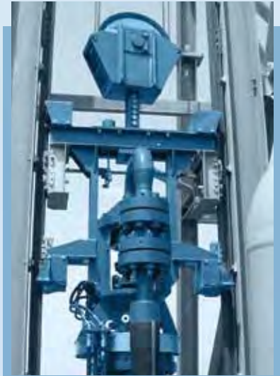
Crosshead with freefall arrestor on installation