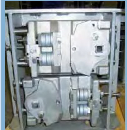
Freefall arrestor detail unit has to be approval with certificate for traveling weight up to 9200kg