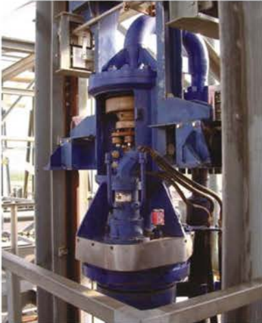
Drill Stem Drive, equipped with Hydraulic Motor