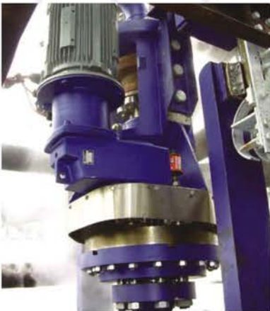
Drill Stem Drive, equipped with Electric Motor