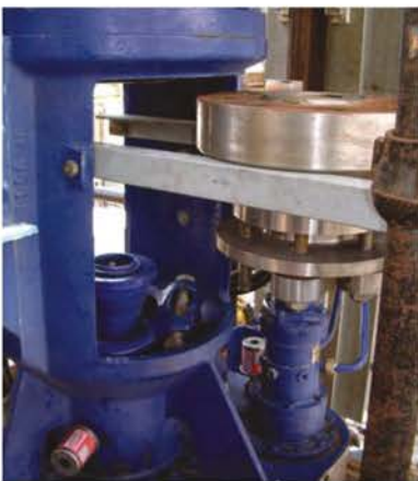
Cartridge Design allows easily and quick exchange of Packing Cartridge

The patented Ruhrpumpen® Drill Stem Drives provide new and safer designs and operational features that should eliminate much of the routine maintenance for swivels (rotary joints) required in existing installations and in the designs of other suppliers.